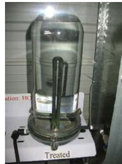
No Scale! (With ScaleNet treated water.)