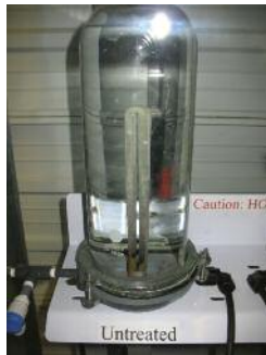
Scale Build-Up (With untreated water.)