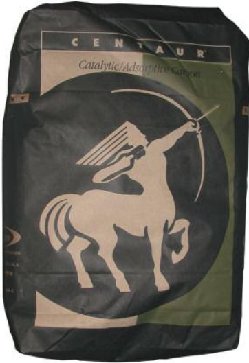
Part # A8056

Catalytic carbon is a liquid phase virgin activated carbon that has been manufactured to develop catalytic functionality. The product is unique in that it concentrates reactants via adsorption and then promotes their reaction on the surface of the pores.