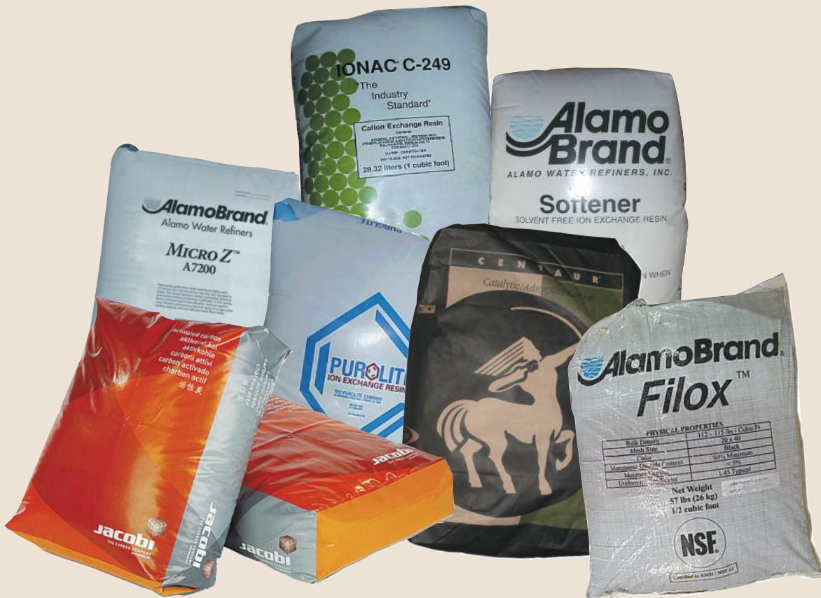
Filter Media and Ion-Exchange Resin