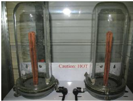
Side-By-Side Test Stand (To test untreated and treated water.)

ScaleNet™ prevents Calcium scale formation, as proven in our San Antonio testing facility using side-by-side glass vessels with heating elements (heated to 180°F) to simulate performance of a hot water heating system. Water, with 16-17 grain hardness was treated at specified flow rates. Tests prove ScaleNet media prevents scale formation. And "de-scaling" was observed after only three weeks of treatment. (As seen in the photo at right, below.)