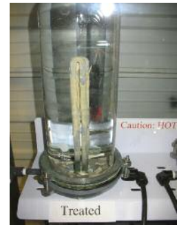
De-Scaling (After sending treated water to scaled-up heating element.)